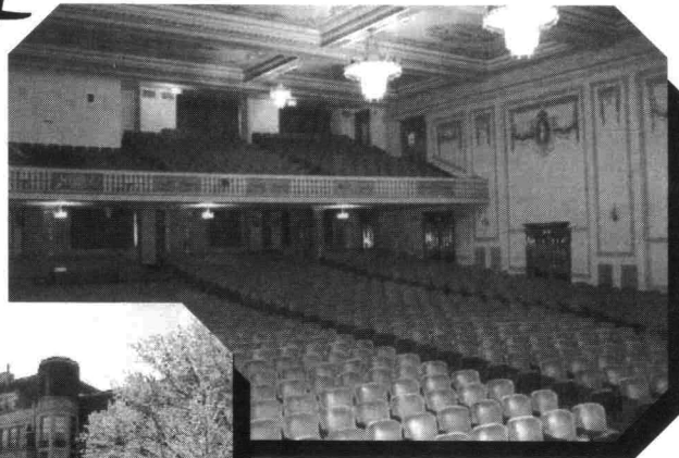
Hibbing High School Auditorium